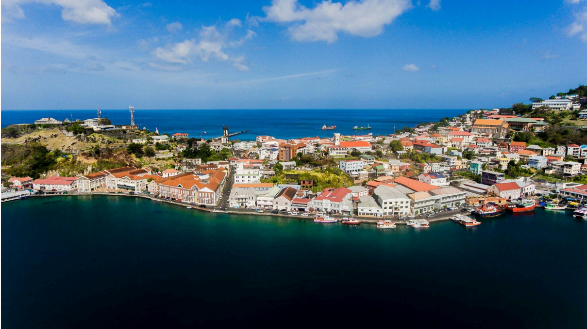
St George's Carenage, Grenada.